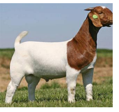
Lamb, Goat, and Swine Entry Forms Due June 23 in Extension Office

Educational programs of the Texas A&M AgriLife Extension Service are open to all people without regard to race, color, religion, sex, national origin, age, disability, genetic information or veteran status. The Texas A&M University System, U.S. Department of Agriculture, and the County Commissioners Courts of Texas Cooperating.